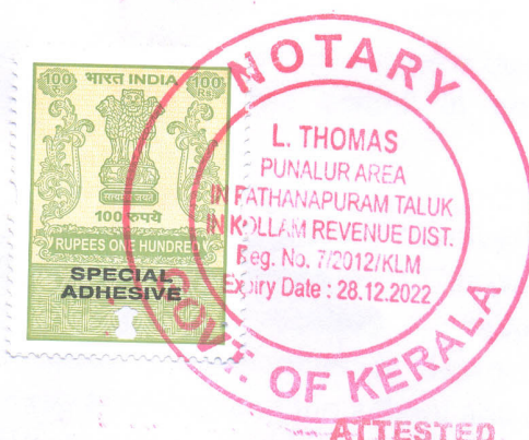
Signature of the Secretary/ Manager

Solemnly affirmed and signed before me by the deponent who is known to me on this the ...25th day of January...2019 At my office at Punalur.